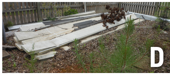
Figure 3. The common denominator of TCA nest sites are dark, secluded, and humid environments created by (a) old tarps and hollow pipes; and the headspace between (b) asphalt roof shingles, (c) plywood, and (d) metal awnings.