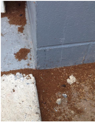
Figure 2 . Dead tawny crazy ants commonly collect in corners and along walls on the outside of infested structures, a telltale sign of infestation.